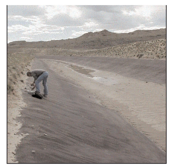
The main canal of the Casper-Alcova Irrigation District, more than ten years after installation of the Teranap Geomembrane.