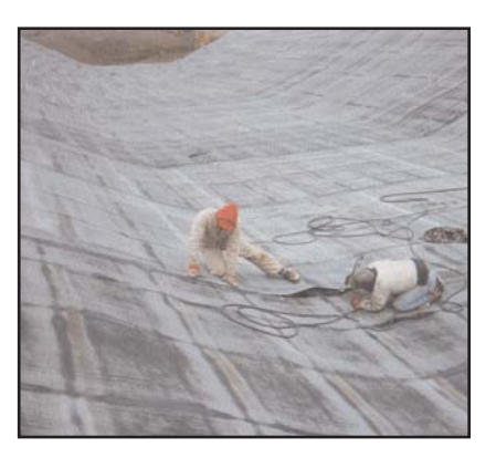
Installation of Teranap Geomembrane in the main canal of the Casper-Alcova Irrigation District in 1991.