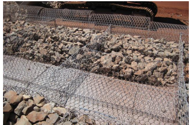
Mechanical means used to assist in the rock packing process

The project tender technical documentation stated that the Gabion work shall only be undertaken by specialist installers, approved and certified by Geofabrics Australasia and highly experienced in this work. A sample group of Gabions were also required to be constructed on site to be used for quality control purposes throughout the duration of the Gabion works. Only once these units had been inspected by relevant parties (including the Gabion manufacturer's representative), and deemed to have been constructed to the acceptable standard, could the main gabion works be undertaken.