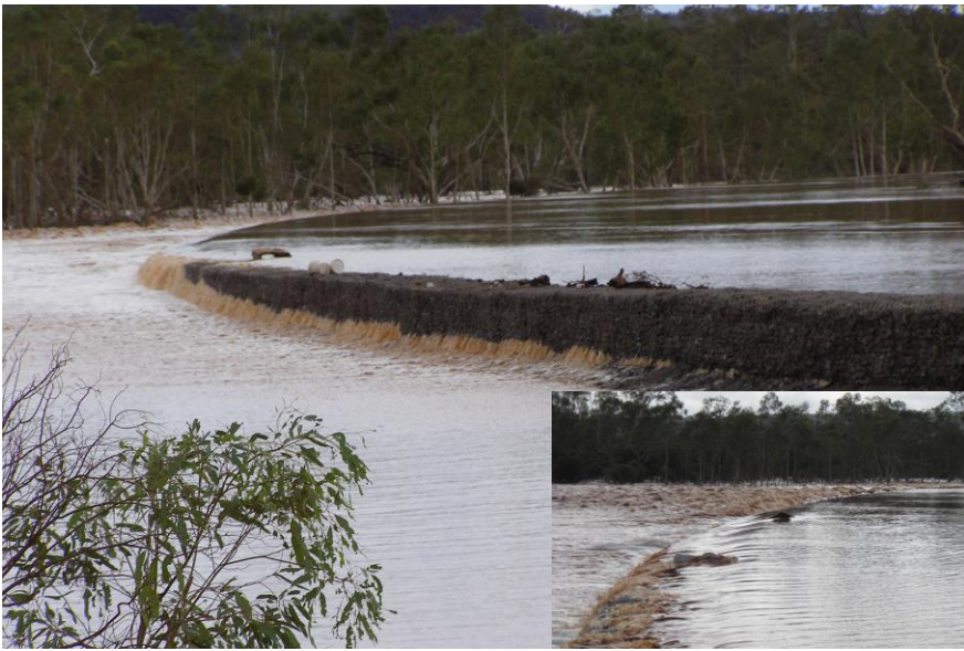
The 980m long Gabion low level causeway being tested during a flood event – March 2009 There was no maintenance required to the structure once the flood waters had receded.

Approximately 1,800m 3 of Gabions, 10,500m 2 of 500mm deep Gabion Mattresses and 12,000m 2 of woven Terramesh soil reinforcement was installed. All woven mesh products specified in the project documents were Galmac (95%Zinc 5%Aluminium Alloy) + PVC coated to the most stringent national and international standards. A valid British Board of Agrément (BBA) certificate was provided as part of the QA documentation.