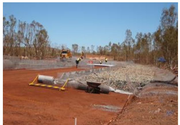
Assembly and filling of the Gabions