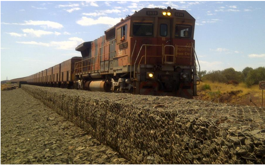
The Gabion causeway protection – March 2013

Approximately 1,800m 3 of Gabions, 10,500m 2 of 500mm deep Gabion Mattresses and 12,000m 2 of woven Terramesh soil reinforcement was installed. All woven mesh products specified in the project documents were Galmac (95%Zinc 5%Aluminium Alloy) + PVC coated to the most stringent national and international standards. A valid British Board of Agrément (BBA) certificate was provided as part of the QA documentation.