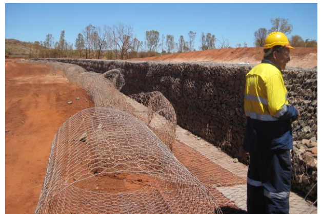
Terramesh panels to anchor the Gabions into the embankment