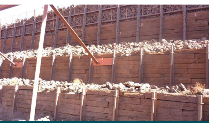
The Terraced North Wall Showing Signs Of Distress