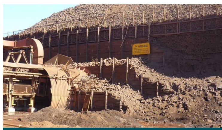
The Original Timber Sleeper North Wall

Geofabrics Australasia also supplied Bidim A34 geotextile for separation behind the Gabion wall, preformed bracing wires to assist in maintaining straight Gabion faces, stainless steel rings (and pneumatic lacing tools) to speed up installation and drainage pipe. Elcoseal<sup>®</sup> X1000, a Geofabrics Australasia manufactured geosynthetic clay liner, was installed horizontally behind the wall to prevent potential saturation of the backfill.